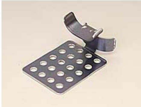
The Roof Clip Bracket Kits are for use with 12-watt heat cables. The roof clips are used to secure 12-watt heat cables to roofs and gutters. Available from HotEdge, LLC.